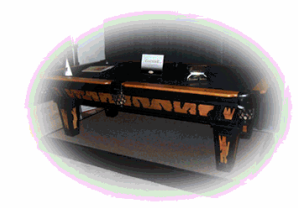
Shown here is the Cochise Tiger Two-Tone Finish