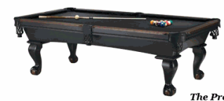
The Prescott Model

Select model tables are the San Carlos, Prescott, Sedona, Cochise, Coronado, and Chiricahua