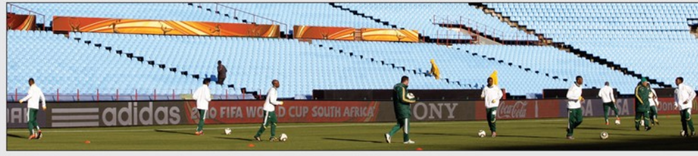
Die slyplekke is blou, maar Loftus is vanaand groen-en-geel wanneer Bafana Bafana Uruguay aandurf. Hier maak spandele hulle gereed vir dié kragmeting.