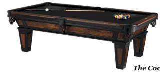
The Cochise Model